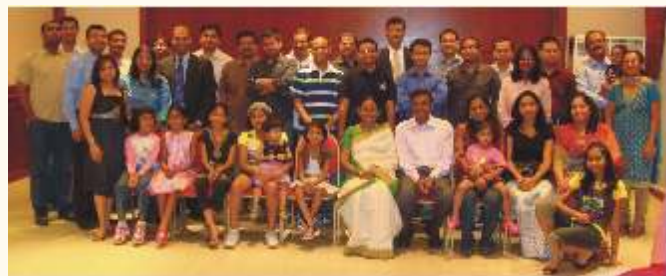
MindTree Minds and their families in our Middle East office

We have also have won deals with large local and multinational groups over the last few months, such as SBS (Saud Bahwan group) in Oman, RSA (Royal Sun Alliance) and Panasonic Gulf in Dubai, Walla Insurance in Saudi Arabia, RTA (Dubai Road Transport Authorities), among others.