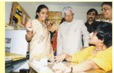
Dr Kalam speaking to a child using ADITI in Vidyasagar