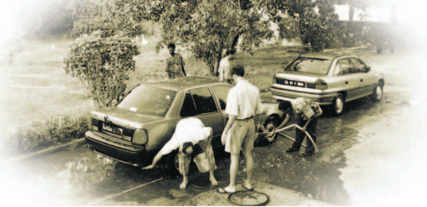
In Vizag, the day begins at Park Hotel with a car wash